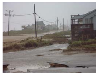
The beach road in Kitty Hawk during Hurricane Isabel.