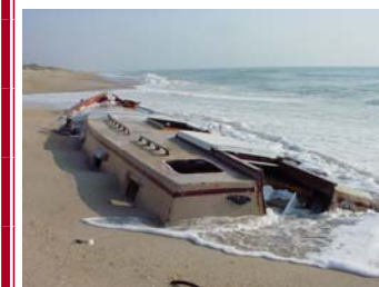
Another recent OBX shipwreck

An unusual storm took sailors by surprise in early May. Because this storm had many tropical characteristics the National Hurricane Center made it the first named tropical storm of the year. This is usually a calm time of year when many sailboats travel north from Florida and the Caribbean to summer ports in the Chesapeake and in New England. According to The Soundings Magazine , on Sunday night May 5th four yachts off the Carolina coast signaled for help in thirty to forty foot seas. The Coast Guard scrambled to save the sailors from three of the sailboats but could not locate the Flying Colours or any of the crew. Our thoughts and prayers go out to the families and friends of the crew of this boat.