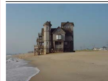
House where filming took place