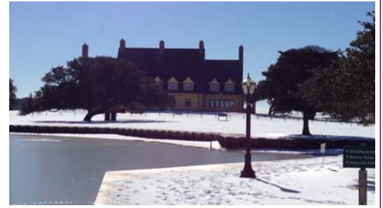
The Whalehead Club in Corolla Jan. 31, 2014. Snow on the ground and the boat basin frozen solid.

This past winter snow storms made it more difficult than usual for buyers to get to the Outer Banks. Despite significantly fewer good buying days, the number of OBX property sales agreements was similar to last year for both January and February. The total number of closed transactions also remained about the same as well. Inventory has risen slightly in just about every market segment over last year so it is unlikely prices will rise this spring. Hopefully the real estate market will heat up with warmer weather.