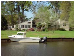
Canal between Duck Woods Dr. and Cypress Ln.