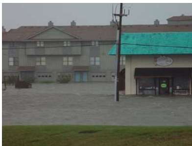
Kitty Hawk during Hurricane Isabel 2003