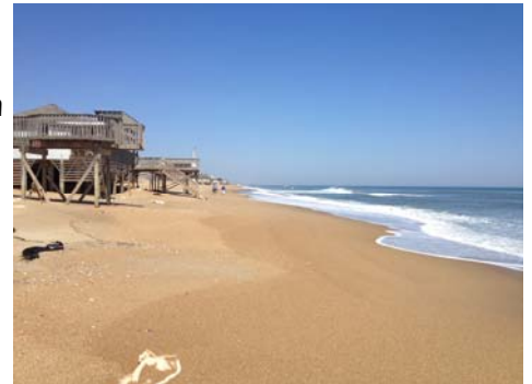
Kitty Hawk Beach by Hawks St April 2, 2014

The town council of Kitty Hawk has begun to take action in limiting the damage from coastal storms. First, they have begun to install storm water drainage lines so that ocean over wash can be removed quickly from the area between the beach road and the bypass. Second, they are finding ways to pay for a beach nourishment project. According to the Coastland Times the most likely scenario is creating Municipal Service Districts. Property owners in each district would contribute to this project. Decisions regarding the nourishment project are likely to be finalized in the fall of this year.