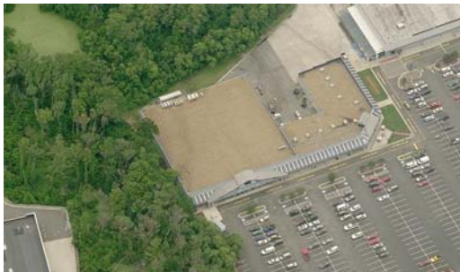
Aerial photo of Seamark with Wal-mart in the top right and Home Depot in bottom left..