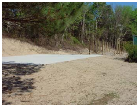
This is the site of the soon to be completed gazebo and basketball area at the park in Chichahauk.

Inventory is still running at a two year supply in most areas making this an especially good time to find a bargain. Hard work and experience from prior difficult markets helped Scott Team Realty achieve a 25% increase in sales over the first quarter of 2007.