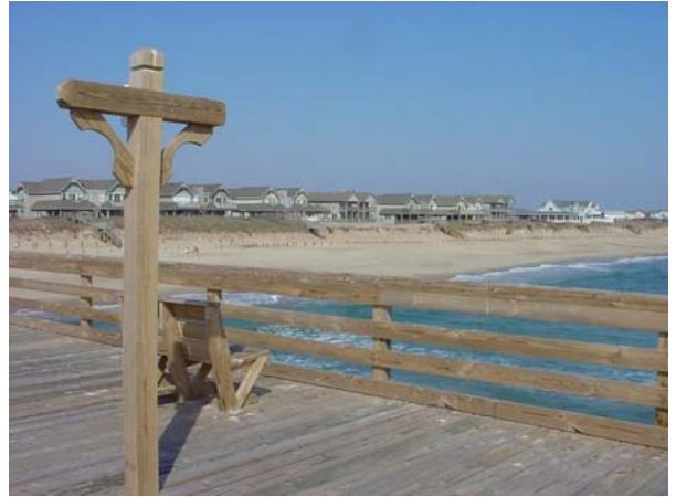
Kitty Hawk Pier

http://www.ncaquariums.com/pressreleases/pierplans.htm