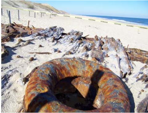
The iron hawsepipe, prominent in this picture, is where the metal chain from the anchor goes through the hull of the ship.

According to the Outer Banks Voice, Hurricane Sandy washed part of the Irma ashore in Nags Head. The Irma wrecked in the 1920's just north of the Wright Memorial. This piece of the schooner was seen north of here just a few years ago. It washed out with the tide and disappeared for a few years. As of this writing the ship wreck can still be easily seen from the Bonnett St beach access in Nags Head.