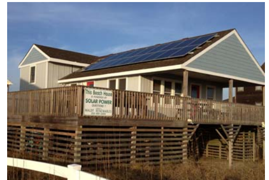
The solar panels on this OBX roof produce electricity that is sold back to the power company when the house is not in use.