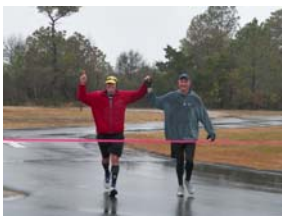
The finish line at the Bodie Island Light