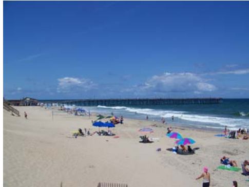
Summer in Nags Head

The Travel section of the US News and World Report picked the Outer Banks as the best family beach in the country recently. Besides our beaches, they cited the history of the area, great local seafood and unique local activities as reasons for being rated number one. World Golf also ranked three local golf courses in the top 100 in North Carolina. This new rating continues the trend of the Outer Banks being a premier golfing destination on the East Coast.