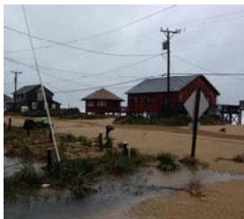
Corner of Luke St and the beach road during Sandy.