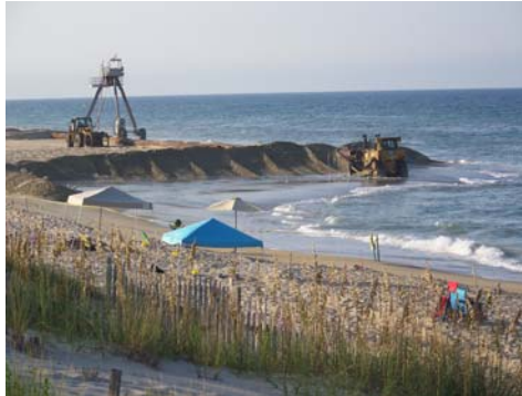
Beach nourishment in Nags Head during the summer of 2011.

According to the Outer Banks Voice, Kill Devil Hills and Duck are now considering beach nourishment. Kitty Hawk is also studying how to better prepare for storms. Beach nourishment has become a more palatable option to protect the ocean front tax base after seeing how Nags Head's project saved homes from storms over the last few years. The county is considering a 1% increase in occupancy tax to help these towns get their projects started.