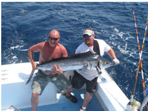
A nice sailfish caught on the Seaducer.

As of late June the interest rate on a 30 year loan was about 4.25%. This is about 1% higher than the record low we had earlier this year. For a $100,000 loan amortized over 30 years this increases the payment by around $56 per month. Hopefully the interest rates will remain steady or go back down but if you've been waiting to refinance or purchase, it may now be time to take advantage of what are still fantastic rates!