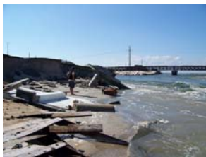
October 2011 Looking west

Offshore: Hop on a charter boat and head for the Gulf Stream where the tuna, mahi and wahoo are plentiful. Who knows, you may catch a sailfish too!