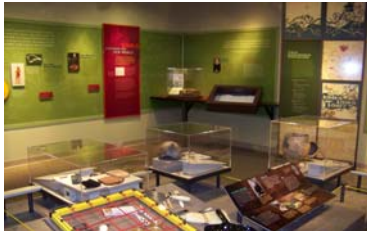
16th Century European artifacts found on the OBX