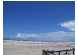
June 2013 Looking east

Hurricane Irene opened a new inlet a few miles north of Rodanthe. An emergency bridge was built so people could continue to have easy access to Hatteras Island. Mother nature has just about closed that inlet today. In fact, no water passes from the sound to the ocean during normal tides.