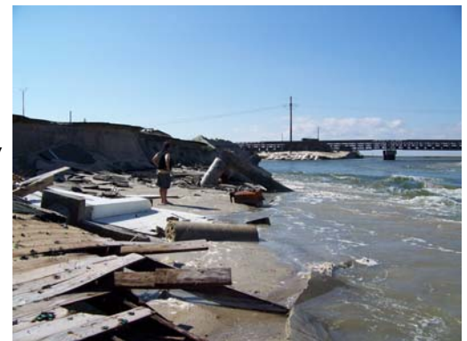
Storm debris in the new inlet.

Hurricane Irene changed the geography of Hatteras Island. When the sound waters rose, the ocean side dunes acted like a dam to the sound waters. In two places where the dunes were high the water broke through and created new channels into the ocean. One of these channels was filled shortly after the storm and the other remains open today. You can see this new inlet in the video at the bottom of this web page: www.scottrealtyobx.com/hurricane_irene . A bridge was built over this new inlet to provide locals and visitors access to Hatteras Island villages.