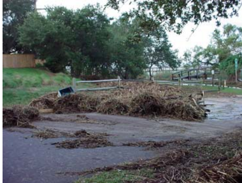
Storm Debris at the sound side path in Kitty Hawk.

On August 28 and 29, Hurricane Irene rolled through the Outer Banks leaving flooding on the northern beaches and parts of Hatteras Island not seen in decades. Hardest hit were the low lying sound side areas. Vacation rental properties north of Whalebone Junction in Nags Head had little or no flooding as this storm's strongest winds pushed the ocean water out to sea. Top winds at the end of the Duck Pier were measured at 75 knots. For more pictures and a video on Hurricane Irene you can call us or go to: www.scottrealtyobx.com/hurricane_irene .