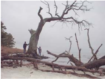
Nags Head Sound Trail