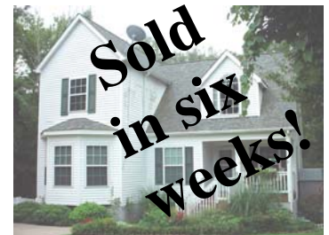
Shady Lane Kitty Hawk

Choosing the right plants and the right time to plant is very important for OBX landscaping. Live oaks and cedars trees are excellent survivors in the harsh OBX conditions. Plant in the Fall for the best rate of survival.