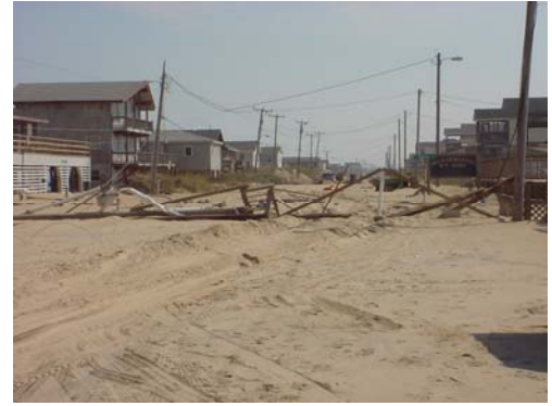
The beach road after Hurricane Isabel

Insurance officials in North Carolina agreed to raise the cost of wind insurance for "beach plan" policy holders. While these coastal insurance rates for wind damage would increase, other inland areas of the state would see a decrease. Dare County and other local municipalities filed a legal challenge to these changes but, as of this writing, were unsuccessful in stopping this increase. For more info on the increases contact Scott Team Realty.