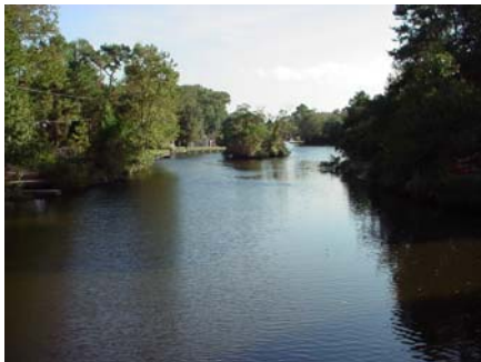
Southern Shores canal looking south from the Dick White Bridge.