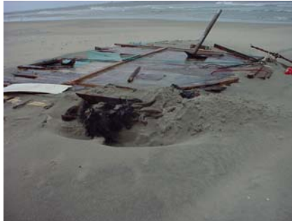
One of the largest pieces of the Boss Lady washed up on Pea Island.

According to the Virginian Pilot , the Boss Lady ran aground on its way in from the fishing grounds in Oregon Inlet New Year's Eve. The U.S. Coast Guard saved the three crew members but the trawler was smashed on the rock groin on the south side of the inlet. Pea Island was littered for more than a mile with thousands of pieces of the boat. All were thankful that no lives were lost.