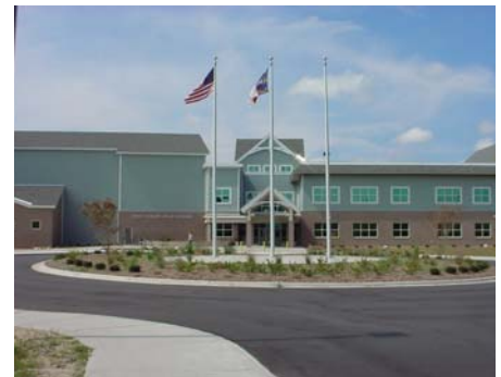
The new First Flight High School

Dare County schools have again been chosen to receive accreditation from the Southern Association of Colleges and Schools. This non-profit, non-governmental Association has been accrediting schools for over 100 years. SACS accreditation is widely recognized by colleges, universities, technical schools and employers as one source to determine the quality of education available to students from Virginia south to Florida and west to Texas. The Dare County school district is one of just 52 districts state wide with this accreditation. For more info on Dare County Schools call Scott Team Realty or go to the County's School website at http://www.dare.k12.nc.us/