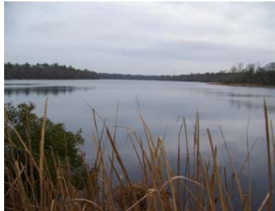
Mill Tail Creek in the Refuge

This time of year is a great time to visit this refuge on Dare County's mainland. This 152,000 acre wildlife refuge is the wintering home to thousands of waterfowl as well as a permanent home to many other types of wildlife. When it is cold and breezy on the beach it is usually much warmer and less breezy here. Take an afternoon and explore some of the 150 miles of roads. Who knows; you might spot a deer, a red-headed woodpecker or a red wolf!