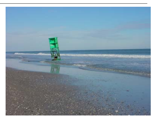
A channel marker washed ashore north of Corolla.

After the Fall fishing season, spring time is the best season to fish on the Outer Banks. The season starts in late March or early April when the shad swim up the sounds to spawn. Shortly thereafter the speckled trout and puppy drum will follow. Fishing for these species is best along the edges of sloughs throughout the Outer Banks sounds. Surf fishing improves once the water gets above about 60 degrees. Warm calm days with clear water are perfect for surf fishing. You never know what you might catch in the surf. It could be a half a pound sea mullet or a 75 pound drum. Get to the Outer Banks, wet a line and relax!