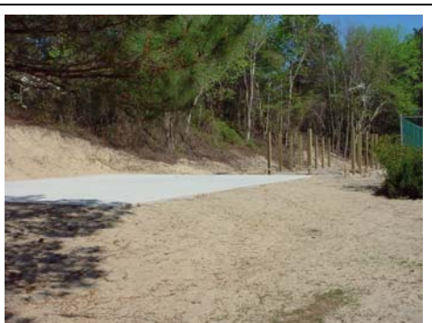
This is the site of the soon to be completed gazebo and basketball area at the park in Chicahauk.

Inventory is still running at a two year supply in most areas making