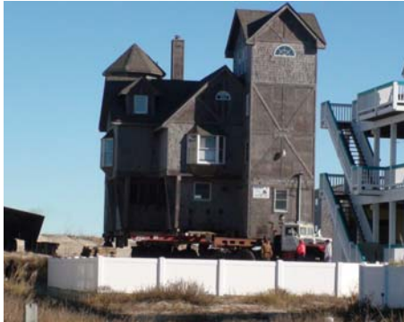
Serendipity almost in its new place.