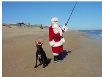
You never know who might be fishing on the OBX!

As the weather starts to cool, the Outer Banks becomes a hot spot for saltwater fishing. Many species migrate by the Outer Banks on their way to their winter feeding grounds. From now until the Holidays, fishing from the surf or in a boat can be world class. A super spot to fish on the Outer Banks in the fall is the north end of Hatteras Island. Here you may be the only person for miles. This is also a great place to find shells. On calm days simply walk over the dune from NC 12 and look for a sandbar that comes close to the beach. A sandbar like this will concentrate the fish within casting distance. Call Scott Team Realty for other good OBX places to fish.