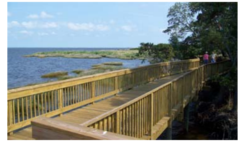
Walk way behind Nags Head Hammocks

Duck's sound side boardwalk is now complete! This wide walkway meanders along and above the sound starting in the town park. Pedestrians can now walk along the sound all the way north to the Blue Point Restaurant. See wildlife in the wetlands behind Nags Head Hammocks or sunsets from just about anywhere on this walkway. It should also keep some pedestrian traffic off of NC12. For more info on and a video of the boardwalk, go to www.scottrealtyobx.com .