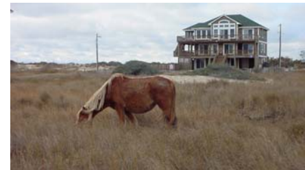
Corova Wild Horse

According to the NC Turnpike Authority web site they have chosen where the bridge is to be located and the final Environmental Impact Study should be completed by the end of this summer. Delays have occurred in the past but, as of this writing, this group claims that the bridge will be complete in 2016.