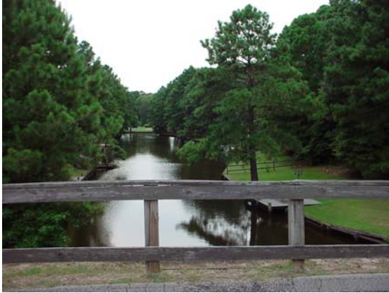
View from the Trinitie Trail Bridge