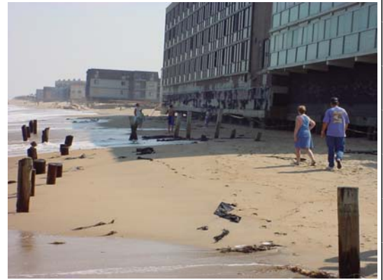
Beach erosion in Kill Devil Hills after Hurricane Isabel.

Like most beaches of our coast, the Outer Banks is susceptible to erosion. The question most discussed about nourishing our beaches is: "Is nourishment really worth it?" Nags Head is getting ready to answer that question by implementing a plan to nourish the majority of the town's beach. Regardless of which side of the debate you fall on, it will be interesting to see how this beach looks and how long the nourishment lasts. The project is scheduled to start as soon as the dredges arrive in June. They are expected to nourish hundreds of feet each day so that vacationers will not be disturbed very long. For more information on where and when the nourishment project is occurring contact Scott Team Realty.