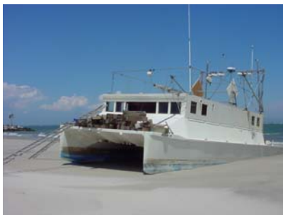
The Makayla & Noah washed ashore just south of Oregon Inlet in March 2009.