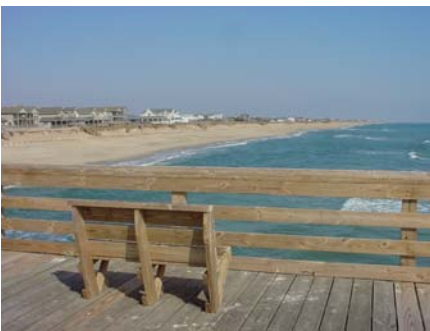
Kitty Hawk Pier Looking North

http://www.outerbanksrealtors.com/aboutus.php#part1