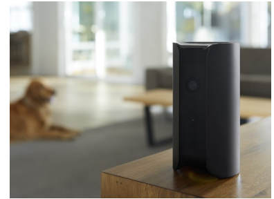
Canary Security Camera

Technology continues to change the way business is done and real estate is no exception. Many owners today have remote cameras inside their beach homes and can see what's going on in the house. Some may be disguised as a book and others may be slightly hidden. In North Carolina it is illegal for a seller to listen in on a conversation but unlikely that many sellers are aware of this law. Cameras are also great ways of keeping track of the house when away. Just recently one Scott Team Realty client purchased a Canary Security Device in the Kitty Hawk Wal-Mart for his second home. For less than $200 he can see the inside of his beach house on his smart phone when he is at home in New England.