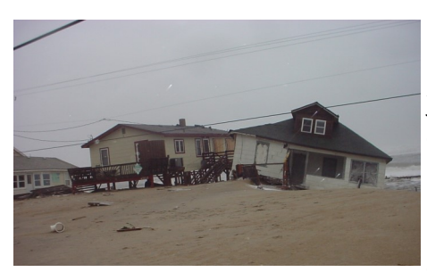
Hurricane Isabel 2003