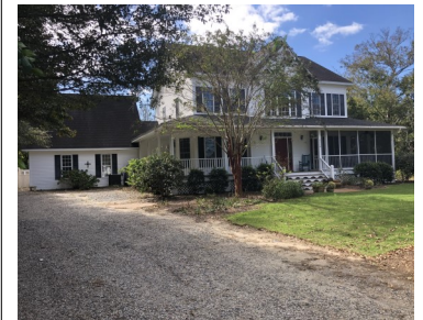
Nature Lover's Dream!

In 2018 we had the second hottest year for sales since the boom years of the early 2000's. The number of transactions in the local MLS was just slightly down compared to 2017. Possible reasons for this decrease include inclement weather, higher interest rates and a lack of updated inventory. Upward trends are rarely a straight line up. Many market segments saw an increase in sales prices and we are optimistic about the direction of this market. For more info on any market segment please feel free to contact Scott Team Realty or go to http://scottrealtyobx.com/market_info/