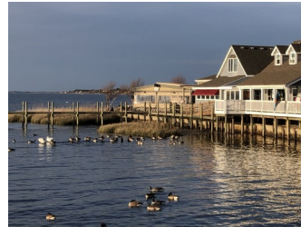
Duck Waterfront 2019

Before the Outer Banks became a famous vacation destination it was famous for duck hunting. Ducks and geese were so prevalent at the beginning of the 20 th century that Dare and Currituck County were home to many commercial duck hunters. Perhaps not in the same numbers as before but many ducks and geese still spend their winters here. If you are at the beach before the spring migration then it's worth taking a walk down the town of Duck's board walk or visiting the Pea Island National Wildlife Refuge. Here you'll see tundra swan, snow geese and a huge variety of ducks enjoying our local waters.