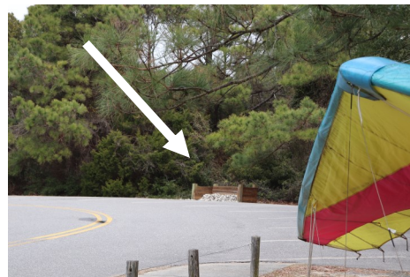
Jockey's Ridge Oyster recycling near hang glider in the park.

The cold months are the time on the Outer Banks for oyster roasts. Not only are local oysters a delicacy but they also play a very important role in the health of our sounds. A single oyster can filter up to 50 gallons of water per day removing substances harmful to fish and other sea creatures from the water. The North Carolina Coastal Federation accepts oyster shells to start new oyster beds in the sound. Both the KDH Recycling Center and Jockey's Ridge State Park will accept your oyster shells. For more info call Scott Team Realty or go to https://nc coast.org/shellrecycling