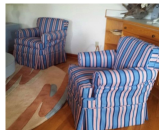
New Slip Covers!