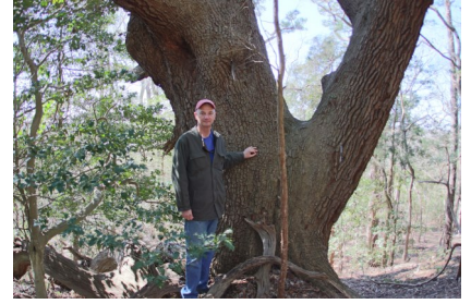
An ancient Live Oak in Nags Head Woods.

The Outer Banks is home to a unique set of flora and fauna. One type of tree that thrives in the sandy soil, windy and salty conditions is the Live Oak tree ( Quercus virginiana ). Frequently you'll see these trees near the ocean leaning towards the southwest because the salty northeast wind affects their growth. These great evergreen trees grow up to 60 feet high and are able to withstand the strong OBX winds.