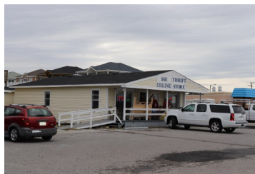
Dare Challenge Building