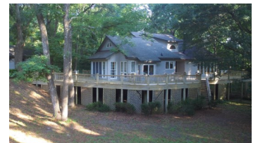
Great Chicahauk Homel

If you google "great reshuffling" today, you'll get pages and pages of articles about how the pandemic changed where people live. It's obvious the Outer Banks has been affected by this trend. Property values have jumped more in the last year than in the last 15 years combined. Also, the vacation rental season has been extended and vacation rental owners are obtaining record revenues. Is this trend a macro-economic trend similar to the industrial revolution? See Reshuffling on page 2.