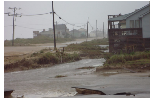
Hurricane Isabel 2003 Kitty Hawk

The Coastland Times reported on Dec 26 that Dare County has earned an improved ranking for flood insurance discounts. The Federal Emergency Management Agency, FEMA, provides discounts for communities that follow specific guidelines that reduce the risk of flood claims. Each municipality on the Outer Banks has done things to receive discounts. According to The Coastland Times, this improvement will reduce flood insurance premiums in unincorporated areas of Dare County by 20%.