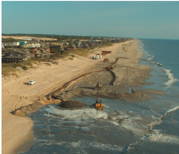
Nags Head Beach Nourishment 2016