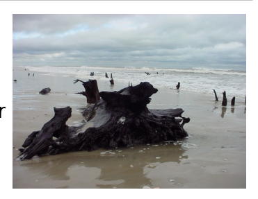
Stumps in the surf from an ancient OBX forest.