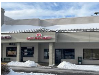
Feb 1, 2026 Snow